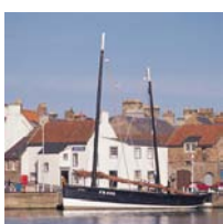
The village of Anstruther.