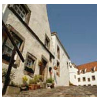
Step back in time in Culross.

Fife has an amazing coastline and the best way to explore this is by walking the Fife Coastal Path. The Path, which currently stretches from the imposing Forth Bridges in the south, to the Tay Bridge in the north, gives access to more than 150km of spectacular scenery, award-winning beaches, natural landscapes, nature reserves and a fascinating heritage. www.fifecoastalpath.co.uk