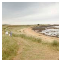
Enjoying Fife's coastal fringe.