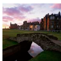
The historic Old Course.