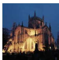
The atmospheric Dunfermline Abbey.